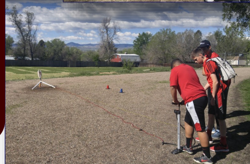
(Pictured left) Team Red prepares to launch their rocket into the field.