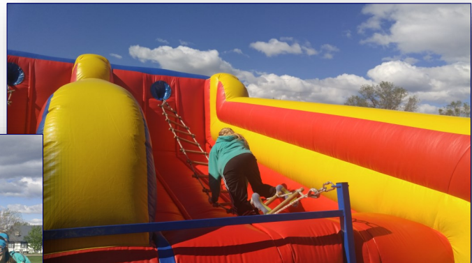
(Pictured left and above) Team Teal tackles the Jacob's Ladder obstacle course. Team Red gets ready to launch their rocket (Pictured below left and below) Team Green competes against Team Purple in relays.